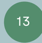
People Served (Each month)

aid in Sri Lanka. Lions Club of Colombo (Host) has pledged to support these children throughout the year. With the donations we have, in 2022 we have been contributing for 14 students and we're now helping 13 students in 2023, but there are many more students who need your support at the moment for their education with the economic crisis in Sri Lanka.