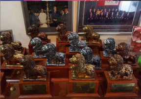
Moratuwa won several Awards for outstanding service at District Convention held at Eagles Lakeside Banquet Hall